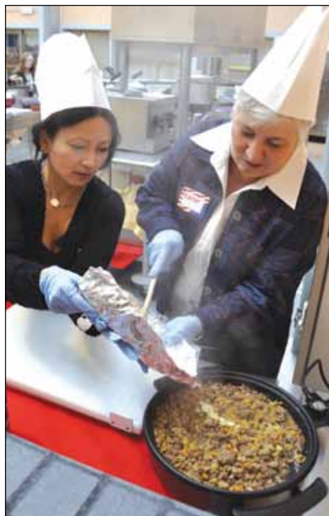
Camp Darby community members volunteer to teach the art of making a perfect Italian ragù at the Italy-wide AWAG conference at Camp Darby Friday-Sunday.